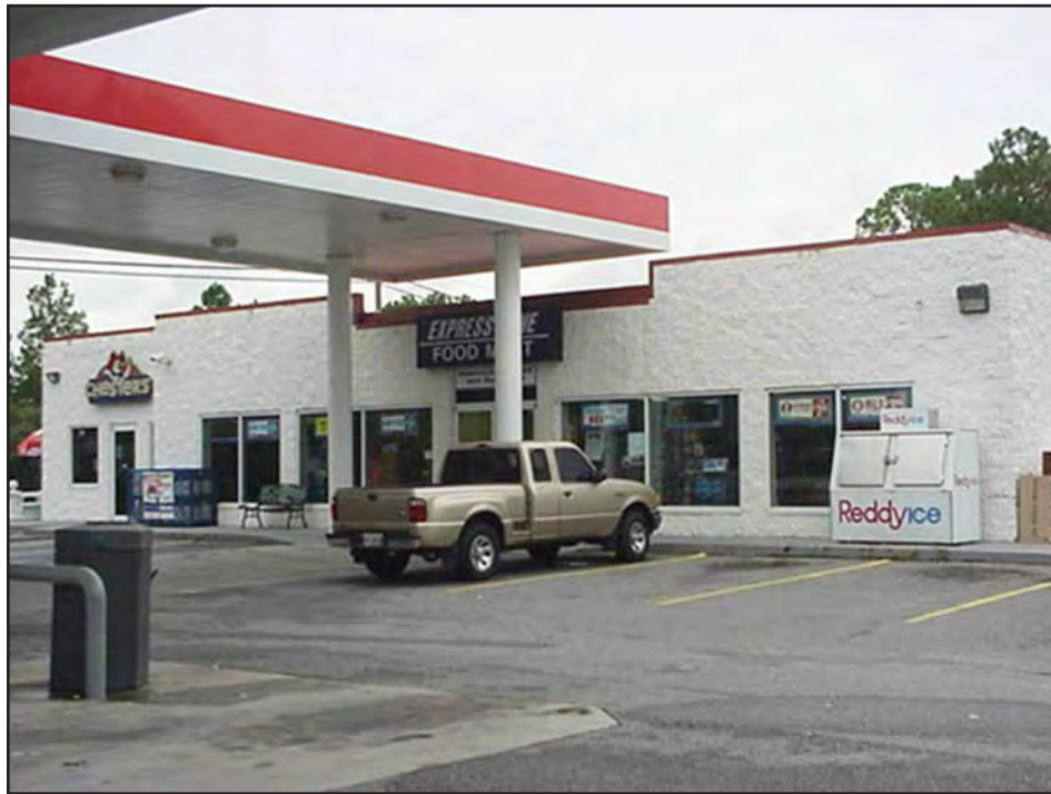
Express Lane Food Mart was voted best gas station. Company Name: Express Lane Food Mart. Address: 2725 S. Main St., Moultrie. Phone: (229) 985-7680. Hours: Sunday-Thursday, 6 a.m.-11 p.m.; Friday and Saturday, 6 a.m.-midnight.