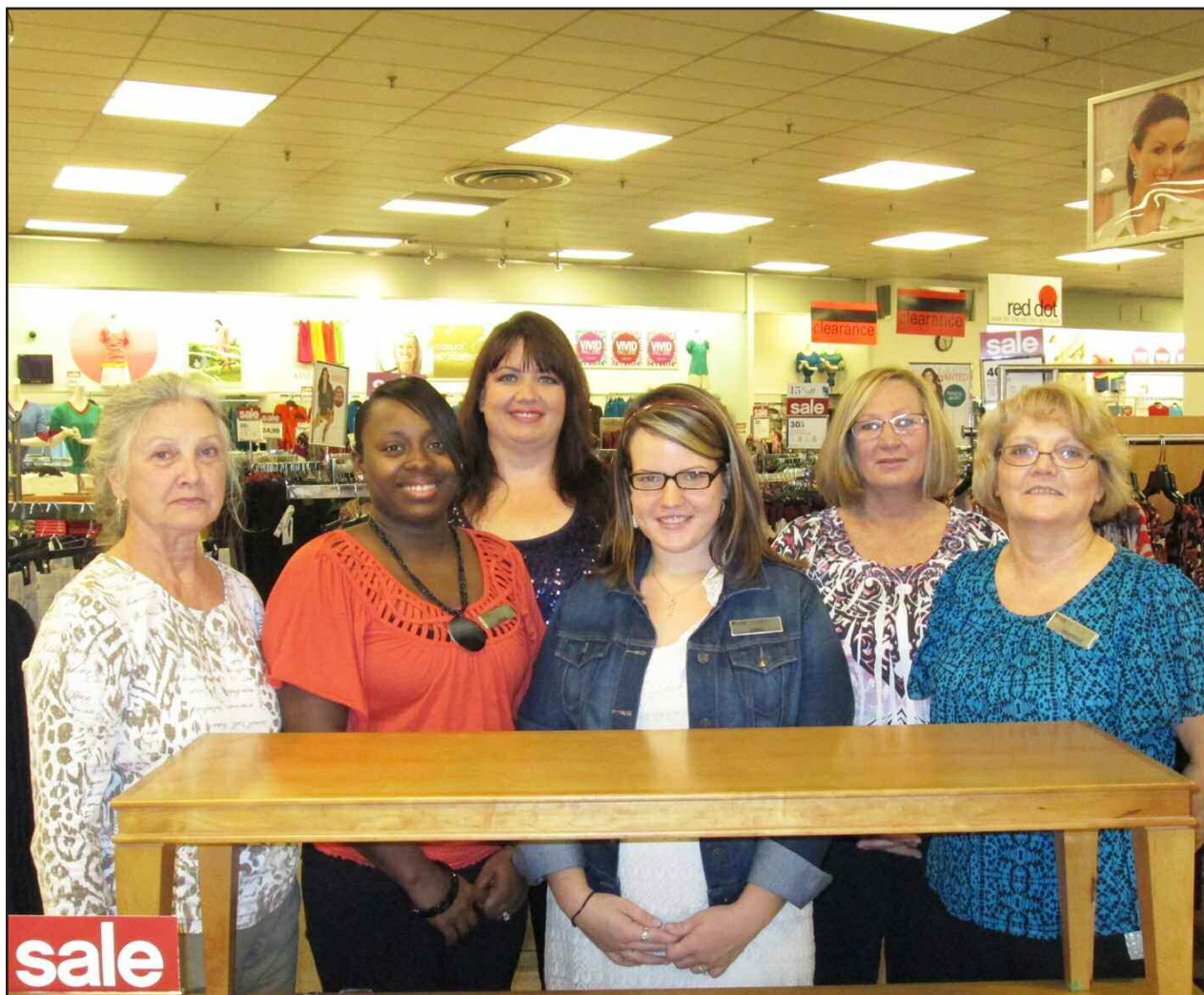
The staff of Belk of Moultrie. Company Name: Belk of Moultrie. Address: Sunset Plaza Shopping Center, Moultrie. Phone: (229) 985-6910.