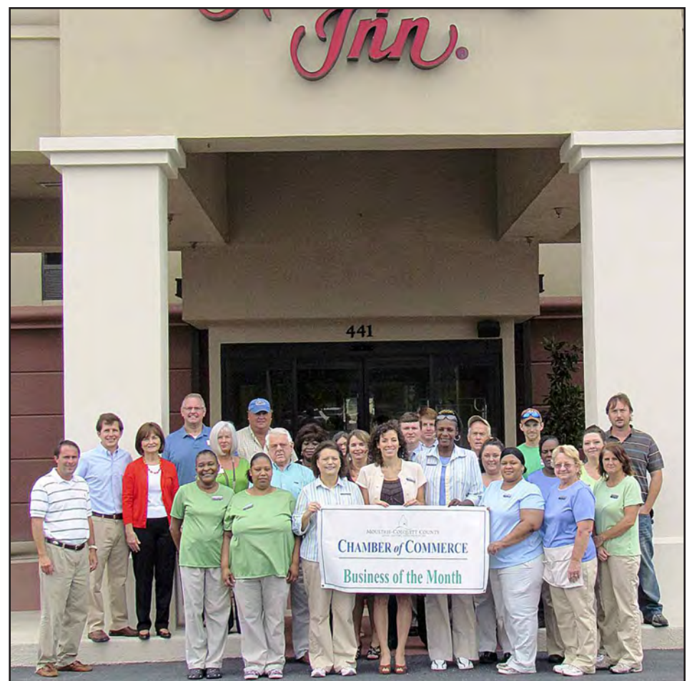
Owners and staff of the Hampton Inn Moultrie. Company Name: Hampton Inn. Address: 441 Hampton Way N.E., Moultrie. Phone: (229) 616-7777.