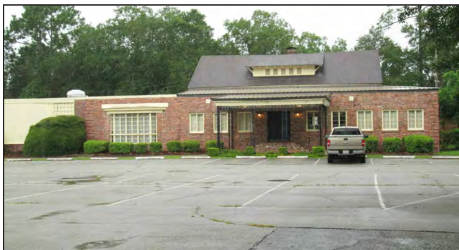
Bentley's Restaurant and Lounge was honored for the community's best steak. Company Name: Bentley's Restaurant and Lounge. Address: 1520 S. Main St., Moultrie. Phone: (229) 985-2634. Hours: Thursday, Friday and Saturday nights.