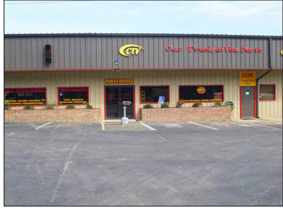
Cox Truck and Van was chosen by readers as best auto salvage. Company Name: Cox Truck and Van. Address: 232 Industrial Road, Moultrie. Phone: (229) 985-1051. Hours: Monday-Friday, 8 a.m.-5 p.m.