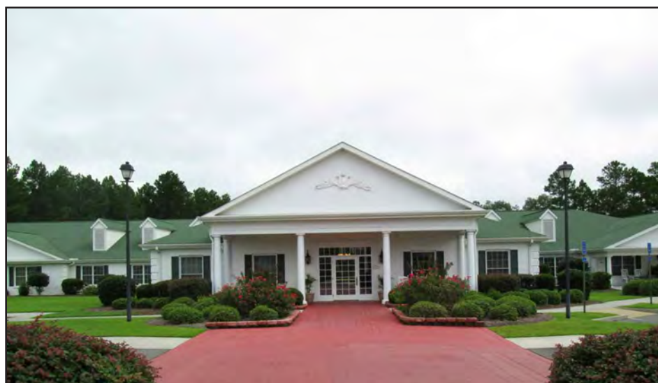
Agape Health and Rehab of Moultrie was named the Best Retirement Community. Company Name: Agape Health and Rehab. Address: 101 Cobblestone Trace. Phone: (229) 985-3637.